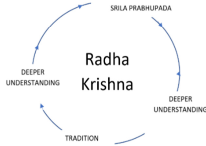
Figure 1: Hermeneutic Dynamic and Srila Prabhupada – Parampara.