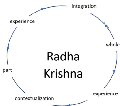
Figure 3: Hermeneutic Circle with Vaishnava Center.