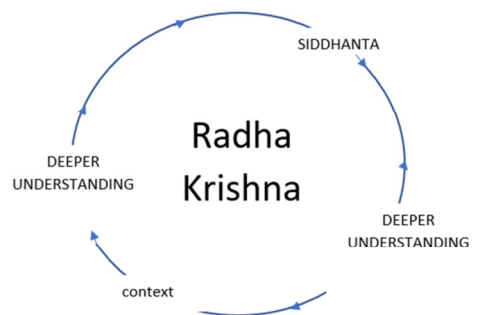
Figure 4: Hermeneutic Dynamic Conclusion of Vaishnava Doctrine and Place, Time and Circumstance (siddhanta and desa-kala-patra)

As expected, these injunctions are broad enough to serve as a frame of reference for interpretation of Vaishnava scriptures, regardless of time, place or circumstances; the dynamics between the work of an interpreter and siddhanta also form a hermeneutical circle as Figure 4 below attempts to show.