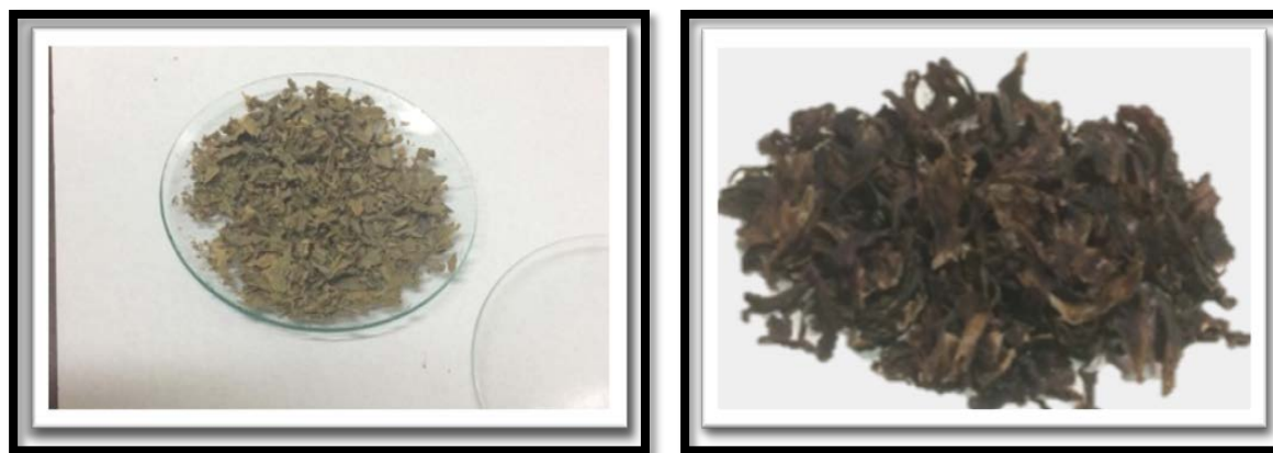
Figure 2. Leaves and calyces.

For the determination of total phenolics, 50 \mu L were mixed with 250 \mu L of the Folin-Ciocalteu 1 N reagent (Analytical grade, Merck). It was left to stand for 8 minutes and then 750 \mu L of 20% \text{Na}_2\text{CO}_3 and 950 \mu L of distilled water were added. Was incubated for 30 min at room temperature and the absorbance was read on a Genesis 20 UV/VIS spectrophotometer (Thermo Scientific, Waltham, Massachusetts, USA). A calibration curve for Gallic Acid (Sigma-Aldrich, Germany) was prepared with concentrations of 50, 100, 200, 300, 400, 500 and 1000 ppm. The results were expressed in mg of Gallic Acid Equivalents (GAE) /g of PM [11].