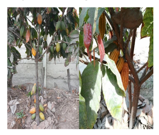
Figure 1 Wild Cocoa tree planted in Lima, Peru

It is indubitable that crop productivity is associated to climatic conditions, hence any modification in this can disturb the development and growth of the cocoa trees. Therefore, there are two phenomena associated to climate change: drought and flooding. Although, the damage caused by water deficit is more intense than water excessive<sup>8</sup>, however, the waterlogging can disrupt the good performance of photosynthesis<sup>9</sup> and it decreases the yield of crops<sup>10</sup>. For that reason, it can be considered a threat to the food security<sup>11</sup>.